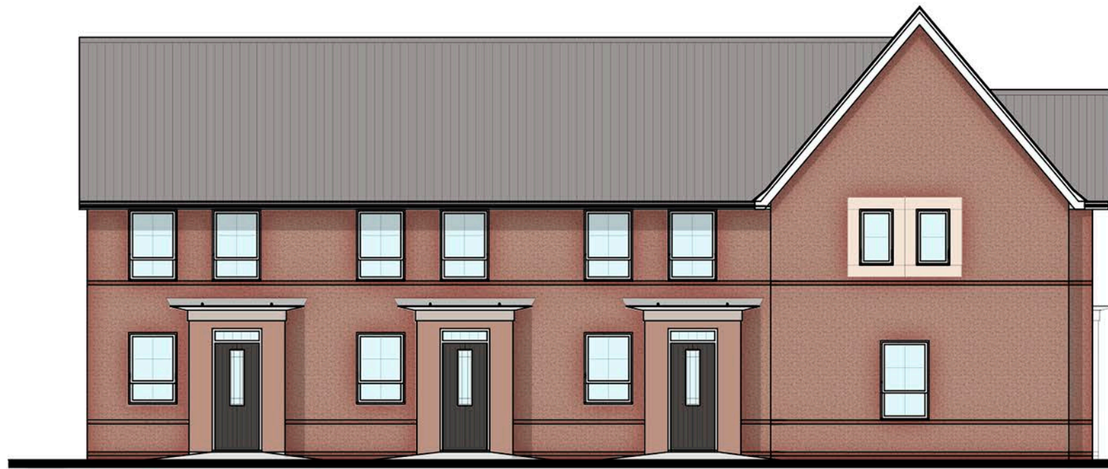
FRONT ELEVATION Ashford (end) Ashford (mid) Ashford (mid) Morpeth