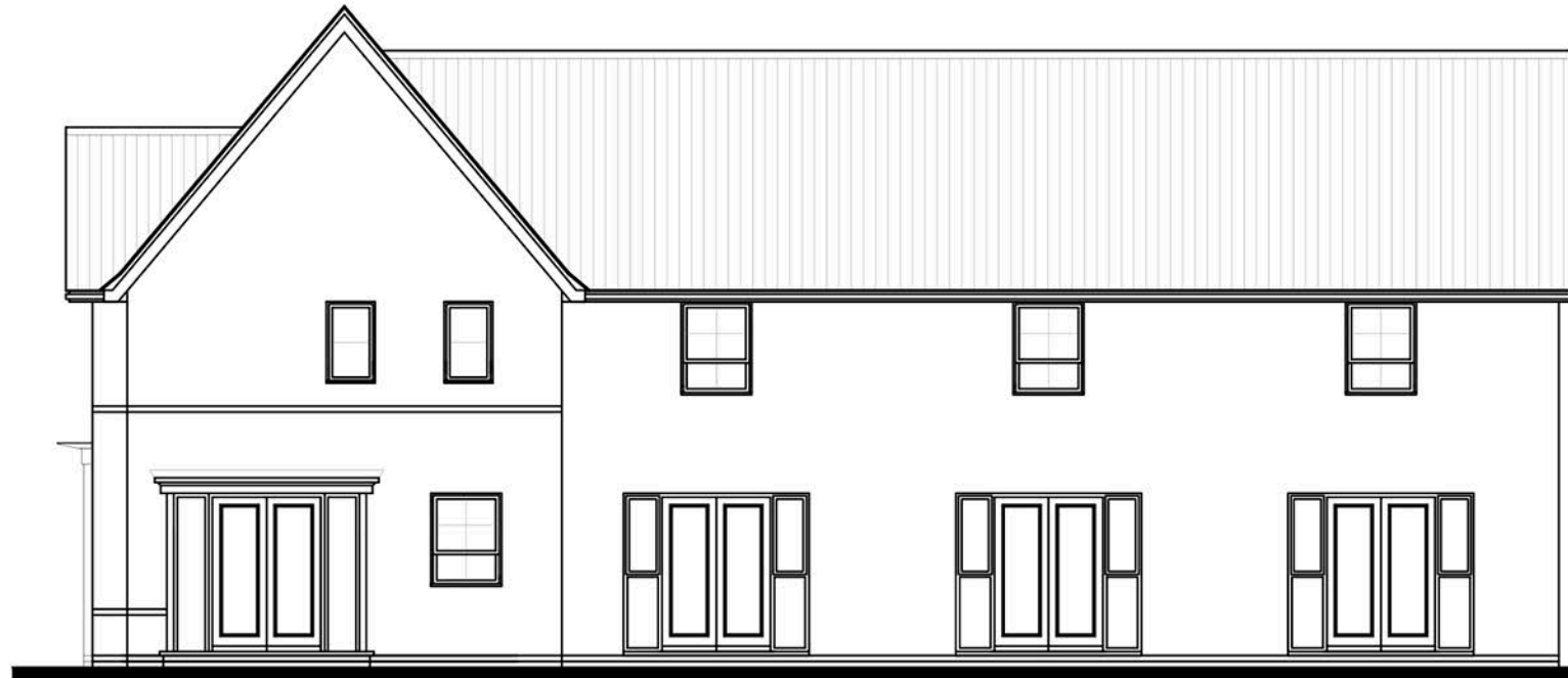
REAR ELEVATION Morpeth Ashford (end) Ashford (mid) Ashford (mid)